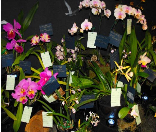
Note the use of the Mid-America registration tags!