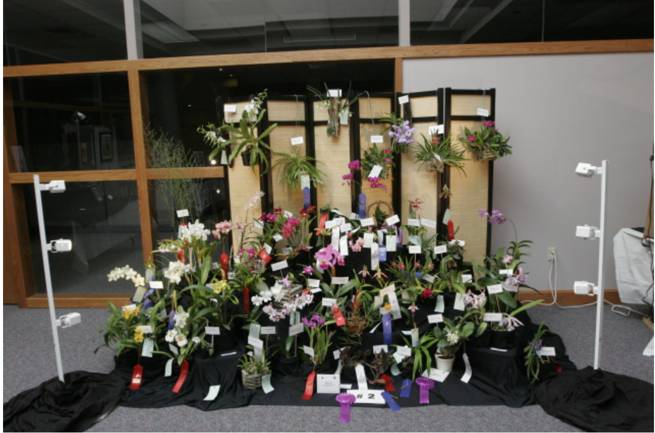
Exhibit: Lincoln Orchid Society

Lincoln Orchid Society November 9-11, 2007 - Lincoln, Nebraska