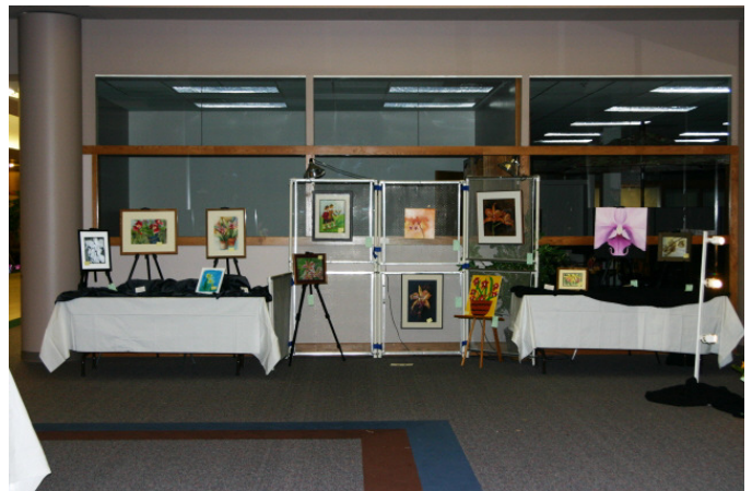
Exhibit: Lincoln Art Guild