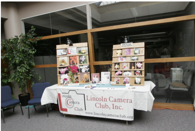
Exhibit: Lincoln Camera Club photograph by Peggy Ruge